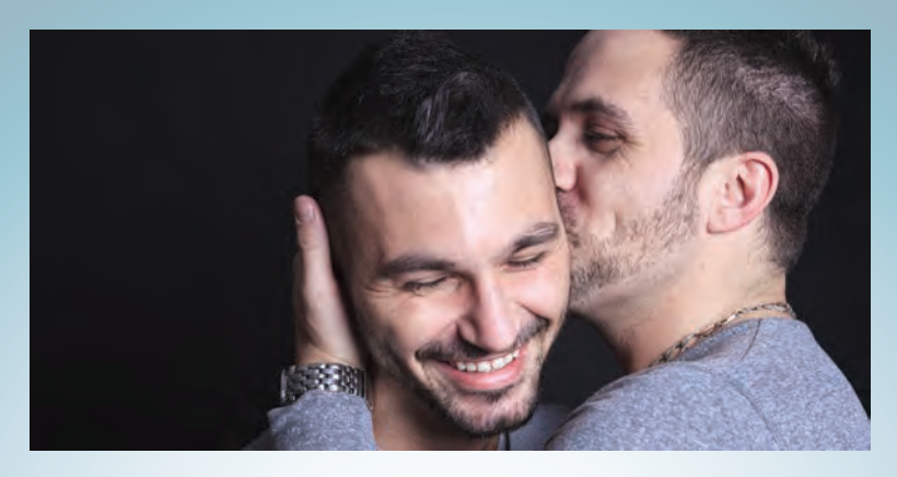
You can get HIV by having vaginal or anal sex without a condom.