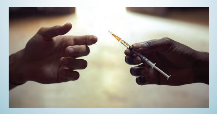
You can get HIV by sharing syringes, needles, and other things used to inject drugs.