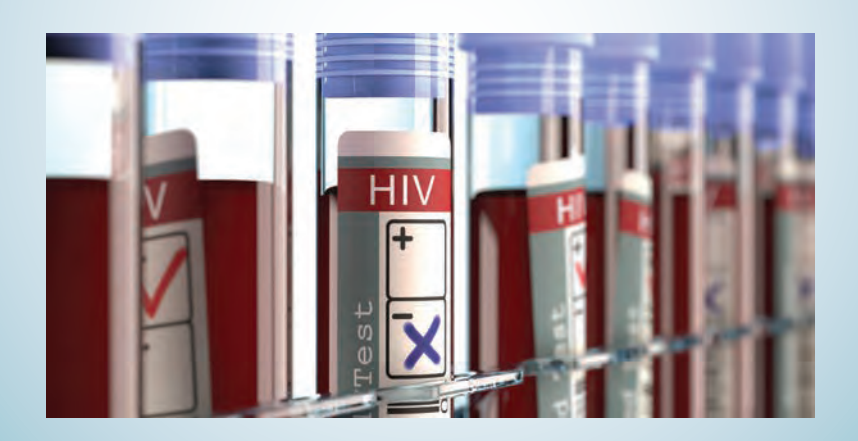
The only way to know for sure if you have HIV is to get an HIV test.