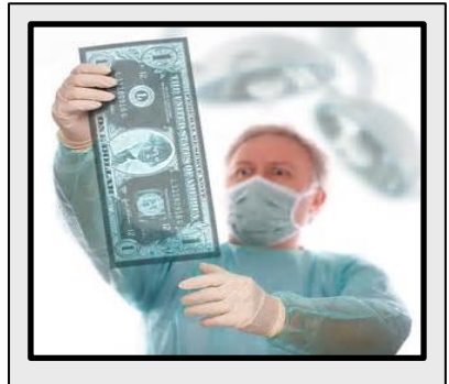
Physician self-referral law (Stark Law)