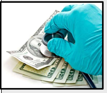
Anti-kickback Statute (AKS)