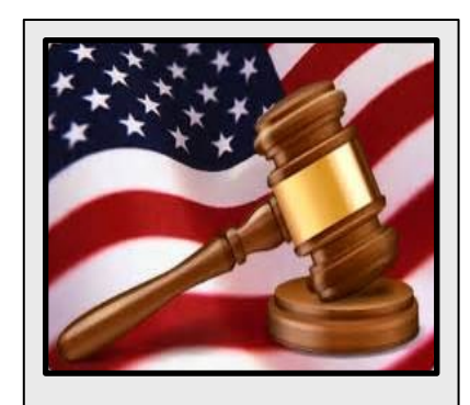
United States Criminal Code